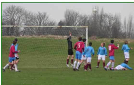
Photos from the Match